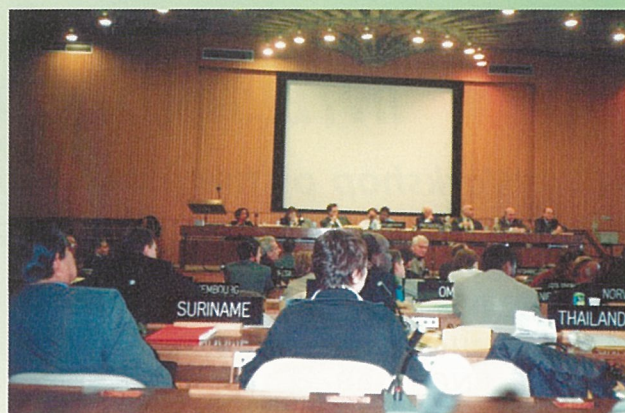
▲ A view of the plenary session of the UNESCO/OECD Meeting on the Drafting of Guidelines for Cross Border Education

After this first meeting the UNESCO/OECD Secretariats will start the drafting of the guidelines, making them available for discussion at the next meetings to be held in late 2004 in Tokyo and in Paris in early 2005. 🇭🇰