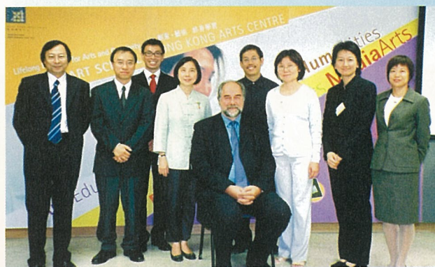
▲ The HKCAA Programme Validation Panel photographed with Senior Management at The Art School of Hong Kong Arts Centre during the Validation Visit

from 2003/2004 to 2006/2007 subject to two requirements. On 13-14 October 2003 the TAS Higher Diploma in Communication Design (Graphic Design) Programme was validated by another HKCAA Panel comprising overseas and local academics and practitioners and was approved for four student intakes from 2003/2004 to 2006/2007 subject to two requirements.