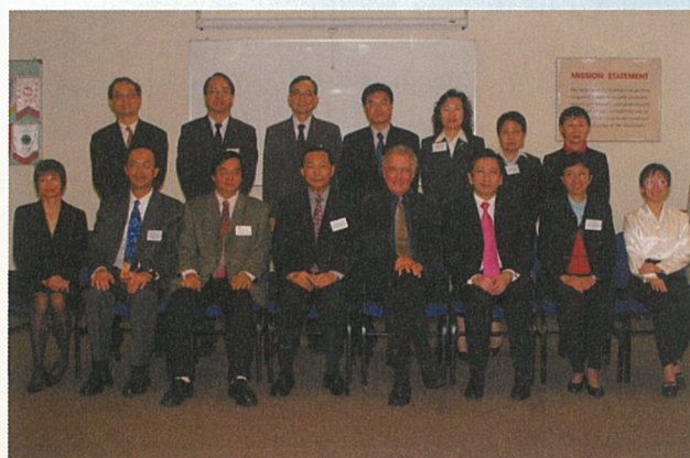
▲ The HKCAA Validation Panel pictured during the Validation Exercise at Caritas Francis Hsu College

comprising international and local academics as well as a local practitioner on 17-18 February 2004. 🏠