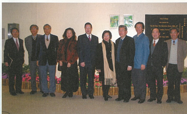
▲ The HKCAA Panel photographed during the Institutional Review Visit at the Vocational Training Council

The Institutional Review was conducted on 16-17 and 19-20 January 2004 by an HKCAA Panel comprising overseas and local academics and practitioners with the outcome that the Panel, much impressed with VTC's unique role and its many contributions in the provision of vocational education and training opportunities in Hong Kong, reaffirmed the Council's role and aspirations and plans for future development. 🏠