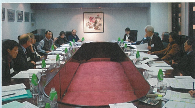
▲ The HKCAA Panel pictured with the Foundation's representatives during the Review of Plans meeting at HKCAA Secretariat

The Foundation commissioned the HKCAA to conduct a three-stage accreditation of Yew Chung College of International Studies and its proposed Associate Degree programme. The Review of Plans was the first stage of the accreditation process, to be followed by the Institutional Review of the College and a programme validation.