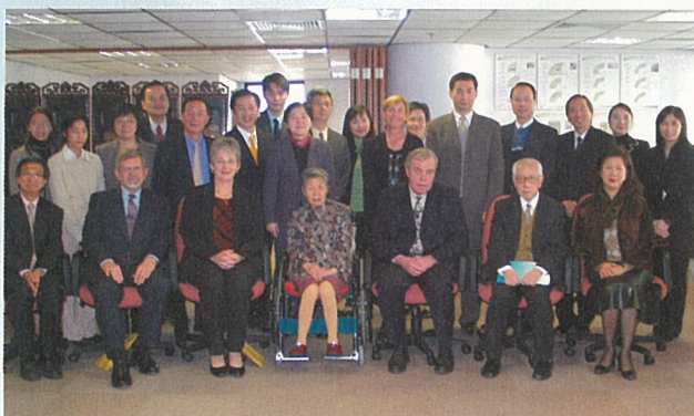
▲ The HKCAA Panel photographed with Senior Management and Staff of Hong Kong Shue Yan College during the Validation Visit

The HKCAA was commissioned by the College to conduct an academic review of the College in December 2003. The purview of the academic review was to evaluate and assess, from the baseline of the previous review conducted by the HKCAA in 2000, the continued evolution of the College's processes for the development and delivery of degree programmes. Since the review conducted in 2000, the College has offered five bachelor's degree programmes in Accounting, Chinese Language & Literature, Journalism & Mass Communication, Social Work and Business Administration.