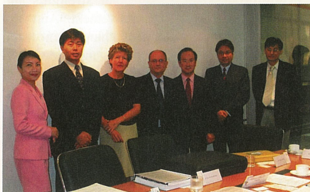
▲ HKCAA Validation Panel pictured during Validation Visit at CCC Kung Lee College

The College is a newly established co-educational senior secondary school sponsored by the Hong Kong Council of the Church of Christ in China (CCC). The College is CCC's latest effort in collaboration with the Hong Kong Government to introduce a new type of education for senior secondary students in Hong Kong. The College has two sections, namely Secondary Section (SS) and Vocational Education & Training Section (VET).