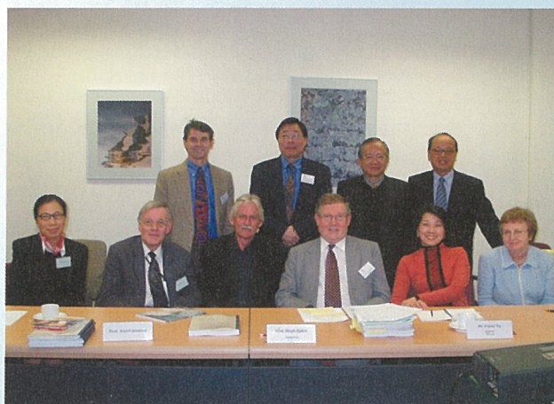
▲ The HKCAA Validation Panel pictured during the Validation Exercise at the Hong Kong Institute of Education

The review of the two-year full-time BEd (Primary) and revalidation of the three-year mixed-mode BEd (Primary) programmes were jointly conducted and approved on 10-12 March 2004 by