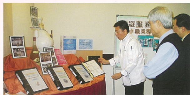
HKCAA Panel at the Career Oriented Curriculum site visit.

HKCAA undertook various assessments on demand. These services include registration of non-local courses, qualifications assessment for individuals, assessment of reimbursable courses under the Continuing Education Fund, accreditation of Insurance Continuing and Professional Development Programmes, and assessment of the delivery of Project Yi Jin in secondary schools and of the Career Oriented Curriculum courses.