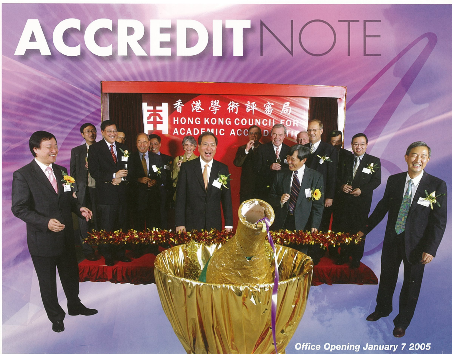
Office Opening January 7 2005