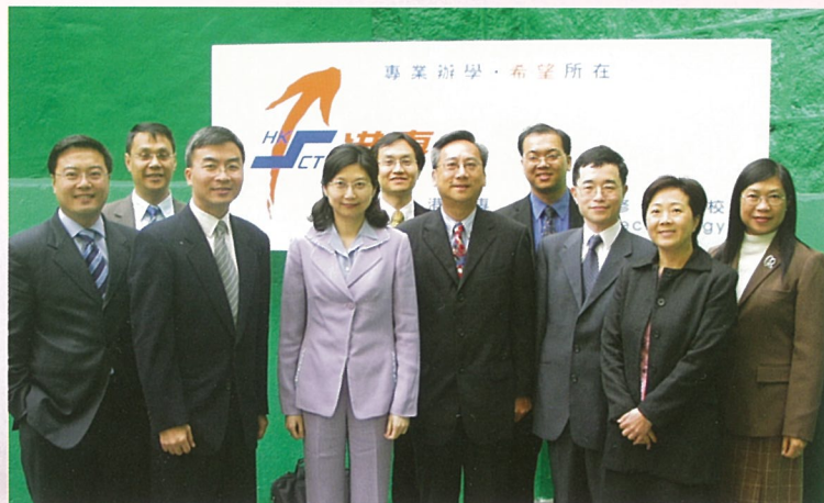
HKCAA Panel pictured with representatives of Hong Kong College of Technology.

The accreditation process has now been streamlined to feature a smaller panel, shorter visit duration and at a lower level of accreditation fees, while maintaining the rigour of review. HKCAA professional staff now serves as both member and secretary of the Panel.